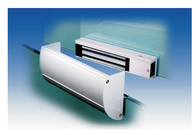
With this, uses this locks will help strengthen its appearance and your door will look beautiful while the value is increased.